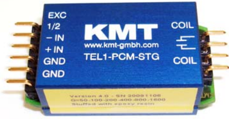
New version 4.0 without external CAL pins

With built-in 220nF capacitor for shaft up to 400mm recommend! Standard version!