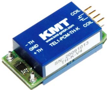
with solder pins for thermocouple

Analog signal bandwidth: 0 - 10 Hz (-3 dB) Accuracy: +/-0.5 % (without sensor) Operating temperature: - 10 to + 80 °C Dimensions: 35 x 18 x 12mm (without th-connector) Weight: each module 13 grams (with epoxy resin) Static acceleration: up to 3000g (housing not filled with epoxy resin) Static acceleration: up to 10000g (housing filled with epoxy resin and without solder pins and external capacitor!)Powering: Inductive (optional Battery, see TEL1-PCM-BATT!)Housing: splash-water resistant IP65 (except the connector pins)