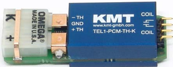
with female K type thermocouple connector

Without built-in capacitor. Only with external capacitor! E. g. 100nF for larger shaft >400mm! Specify at order!