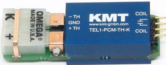
with female K type thermocouple connector

Without built-in capacitor. Only with external capacitor! E. g. 100nF for larger shaft >400mm! Specify at order!