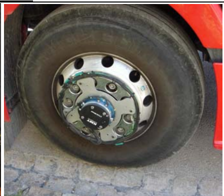
Application pictures of CT8-Wheel