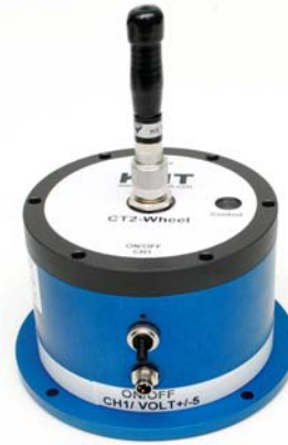
320-1280kbit version with external antenna (cars and trucks wheels)