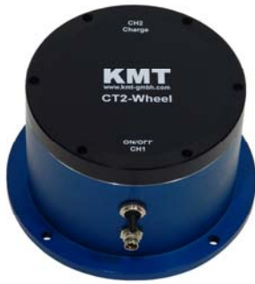
40kbit version internal antenna (cars wheels)