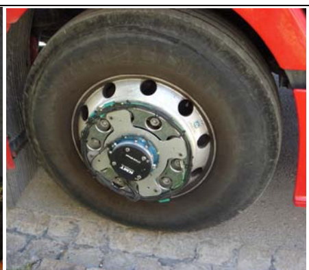
Application pictures of CT8-Wheel