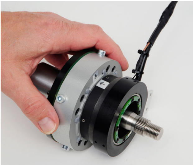
Small, flexible and high-precision: The new steering effort sensor KMT-CLS

Measurements at the original steering wheel of automobiles and trucks